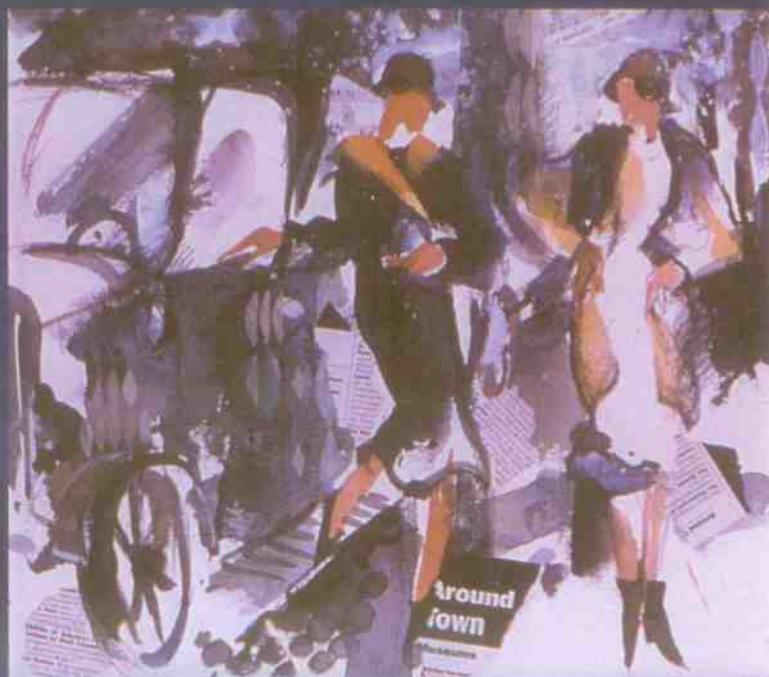
Around Town , London Collection