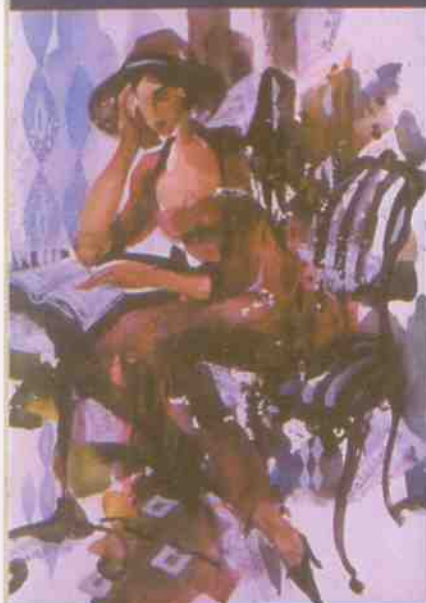
Sitting Pretty , Gorbachev Foundation Collection